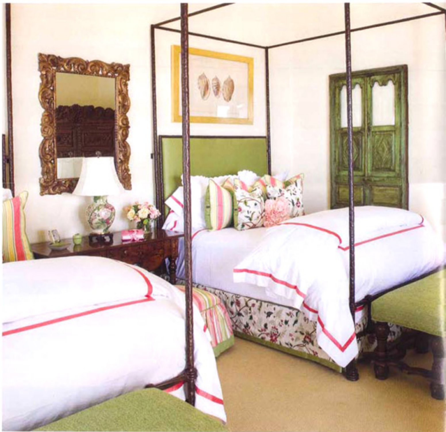
(ABOVE AND FAR RIGHT) | The room of John and Leticia's daughter uses a combination of her favorite color scheme, green and pink. A blend of fabrics and decorative items with this combination were used to personalize the room's design. Tile combinations, elegant furniture and unique artifacts help to create style and character that permeates the entire home.

with those migrating whales visible from the house they have the best view on the planet."