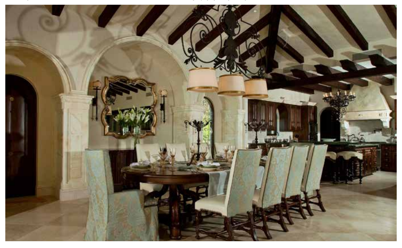
Photo Info: Private Residence, San Jose del Cabo