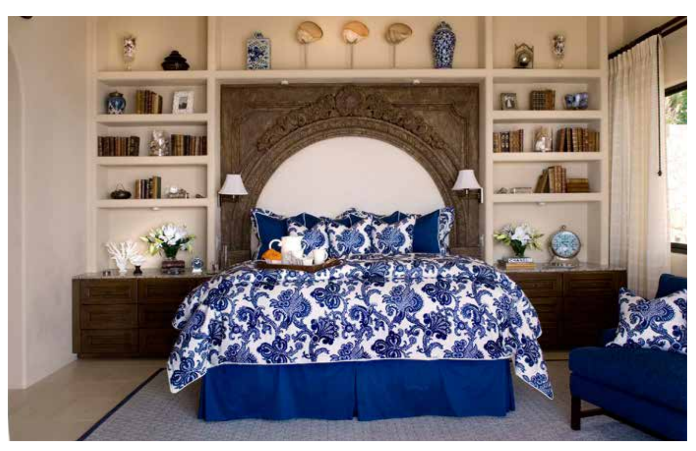
Photo Info: Casita Hahn Residence - Villas del Mar, Palmilla, Los Cabos