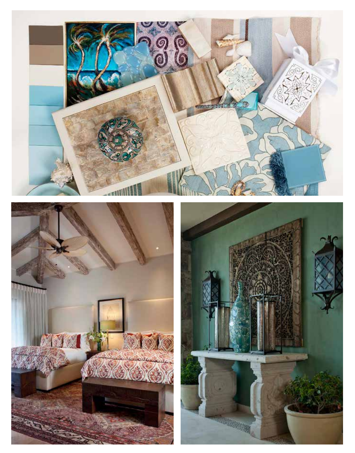
Photo Info : Private Residence, San Jose del Cabo, Mexico Photography by: Hector Velasco