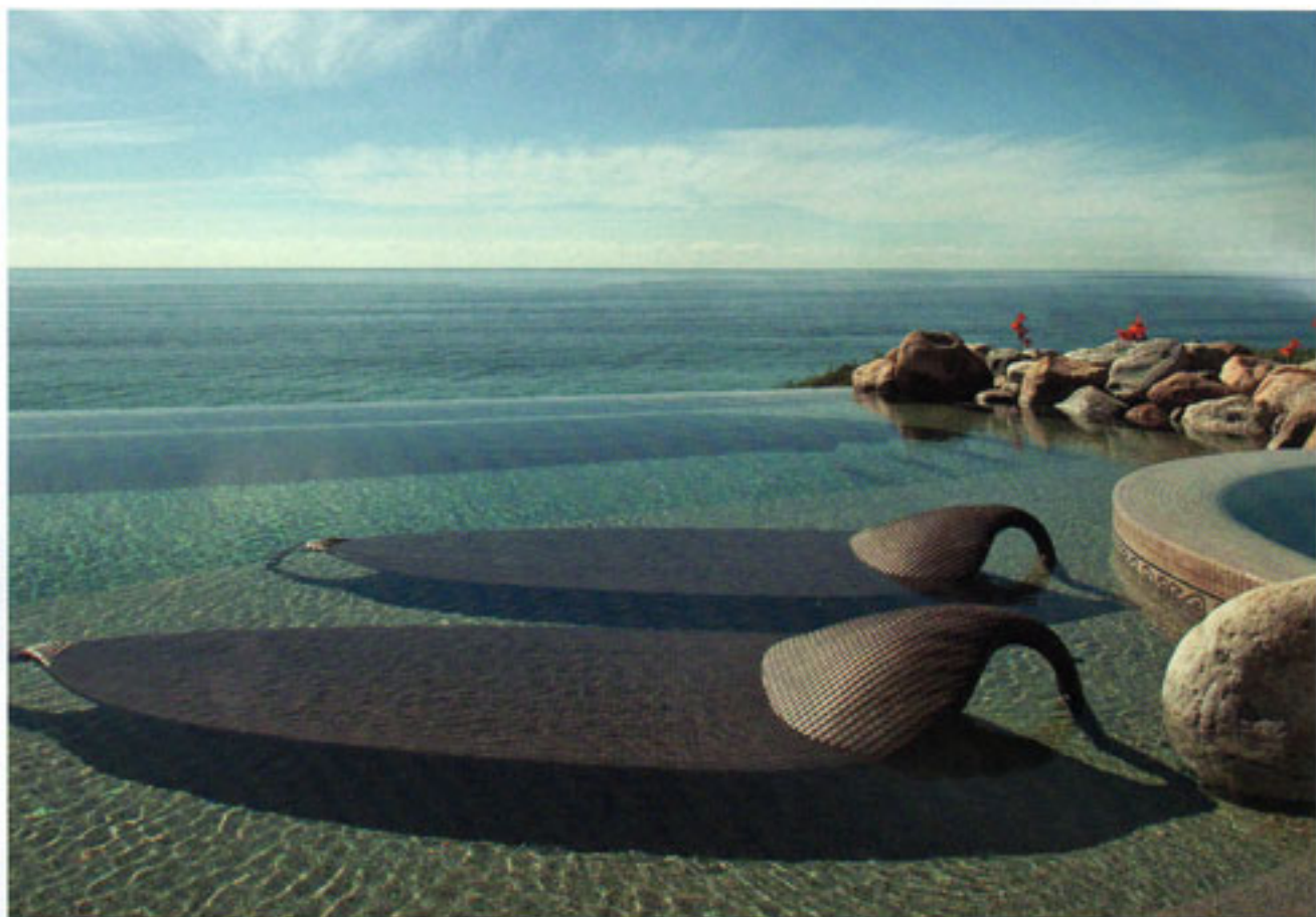
THIS PAGE: Banana-leaf chairs situated inside the pool create an exotic spot to cool down. The zero-edge pool blends with the ocean beyond. OPPOSITE: A fire pit adds architectural interest to the outdoor space. A palm frond roof (or palapa) covers the bar area of the terrace.