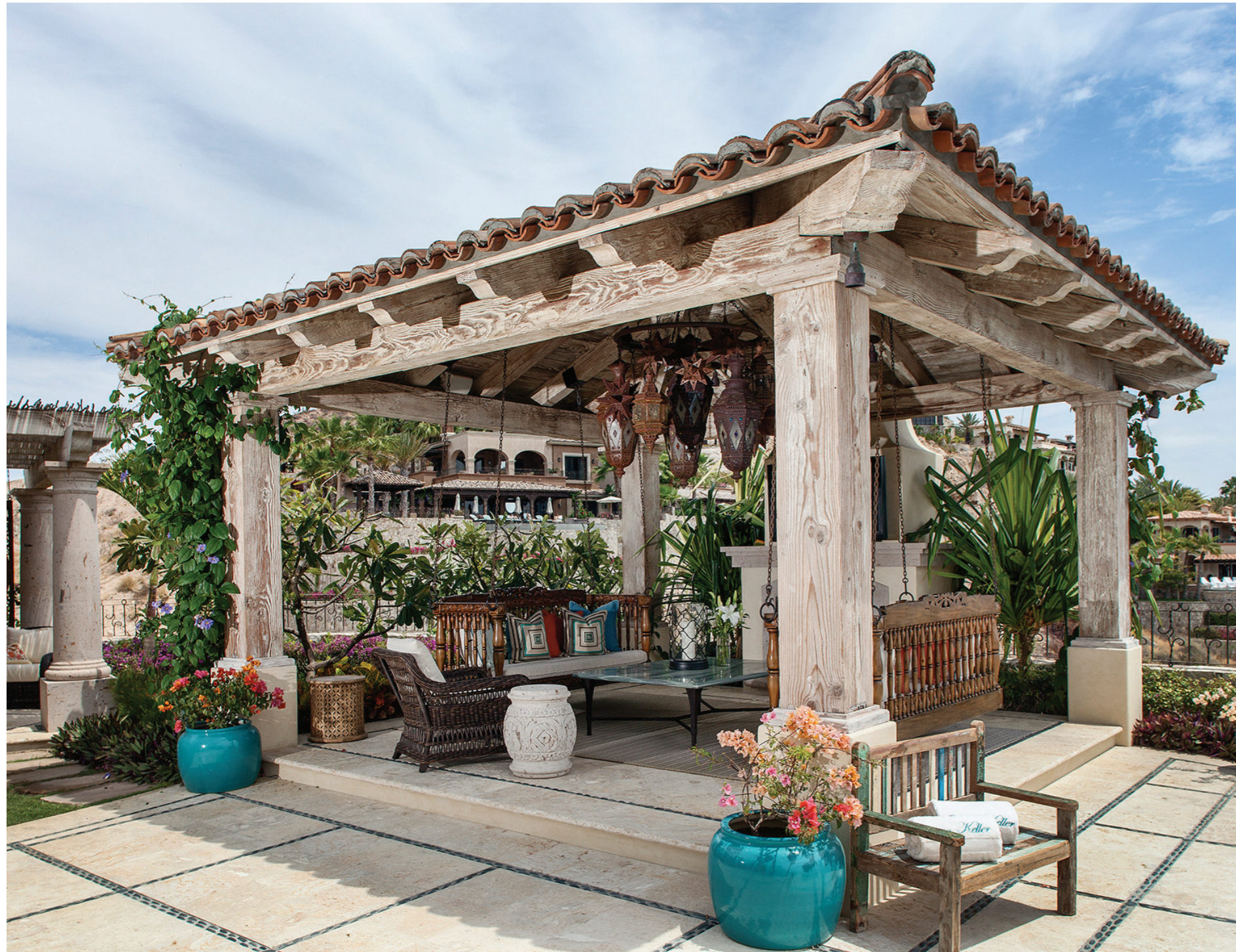
THE FLOW OF THE HOUSE IS RELAXED AND TRADITIONAL. ENTRY IS THROUGH THE MAIN COURTYARD TO A GARDEN WITH A LARGE MEXICAN FOUNTAIN WHERE TRADITIONAL TALAVERA TILE WAS USED.